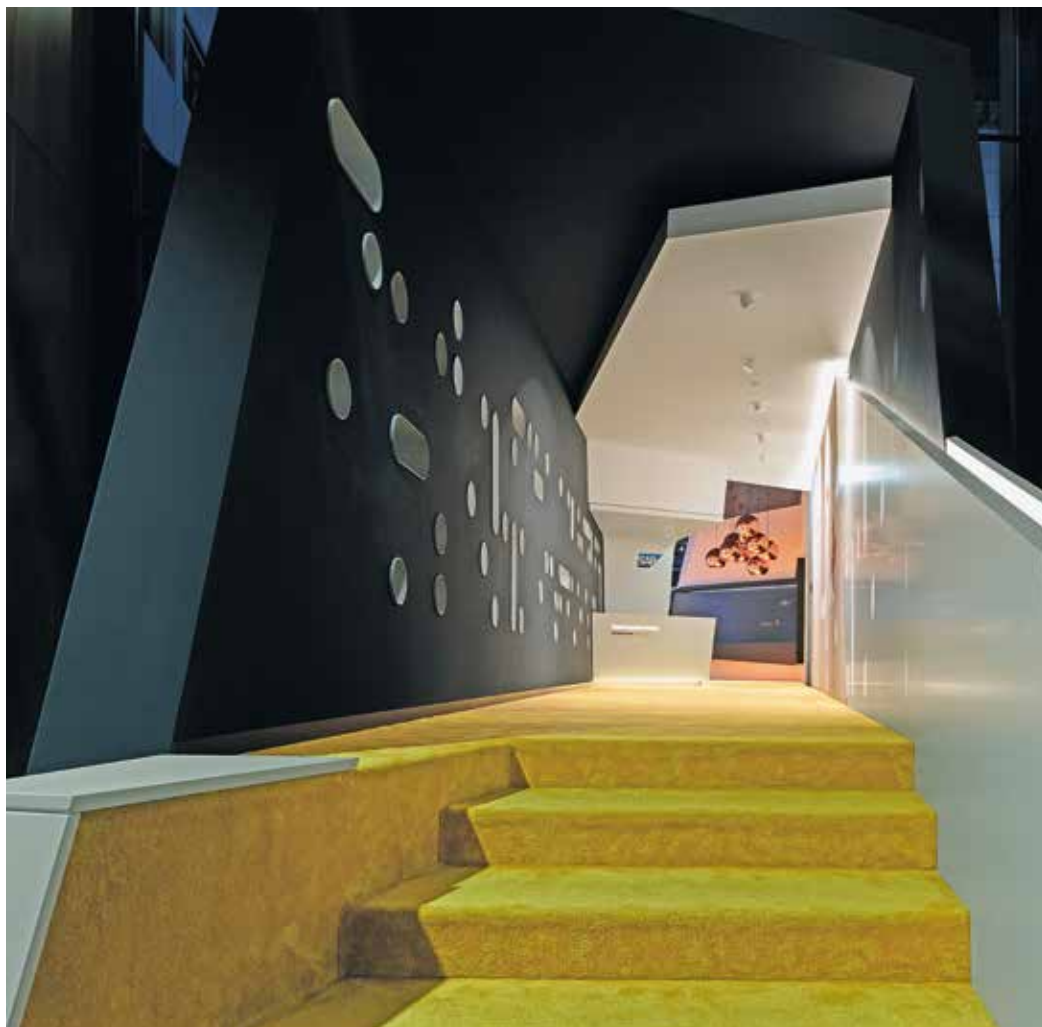
↑ | Exhibition space ← | Connective corridor