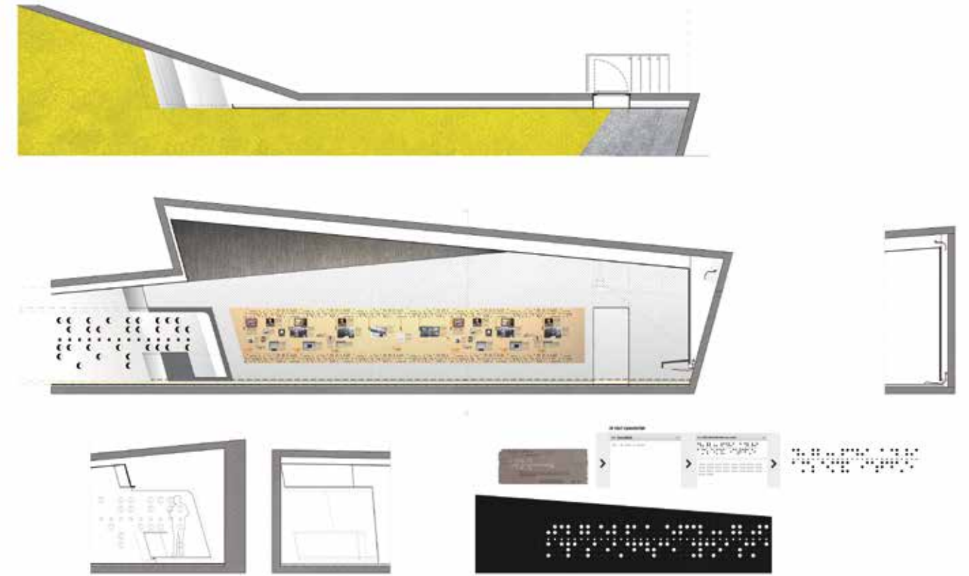
↑ | Section, entrance and exhibition ↓ | Detail, façade inspired by punchcards