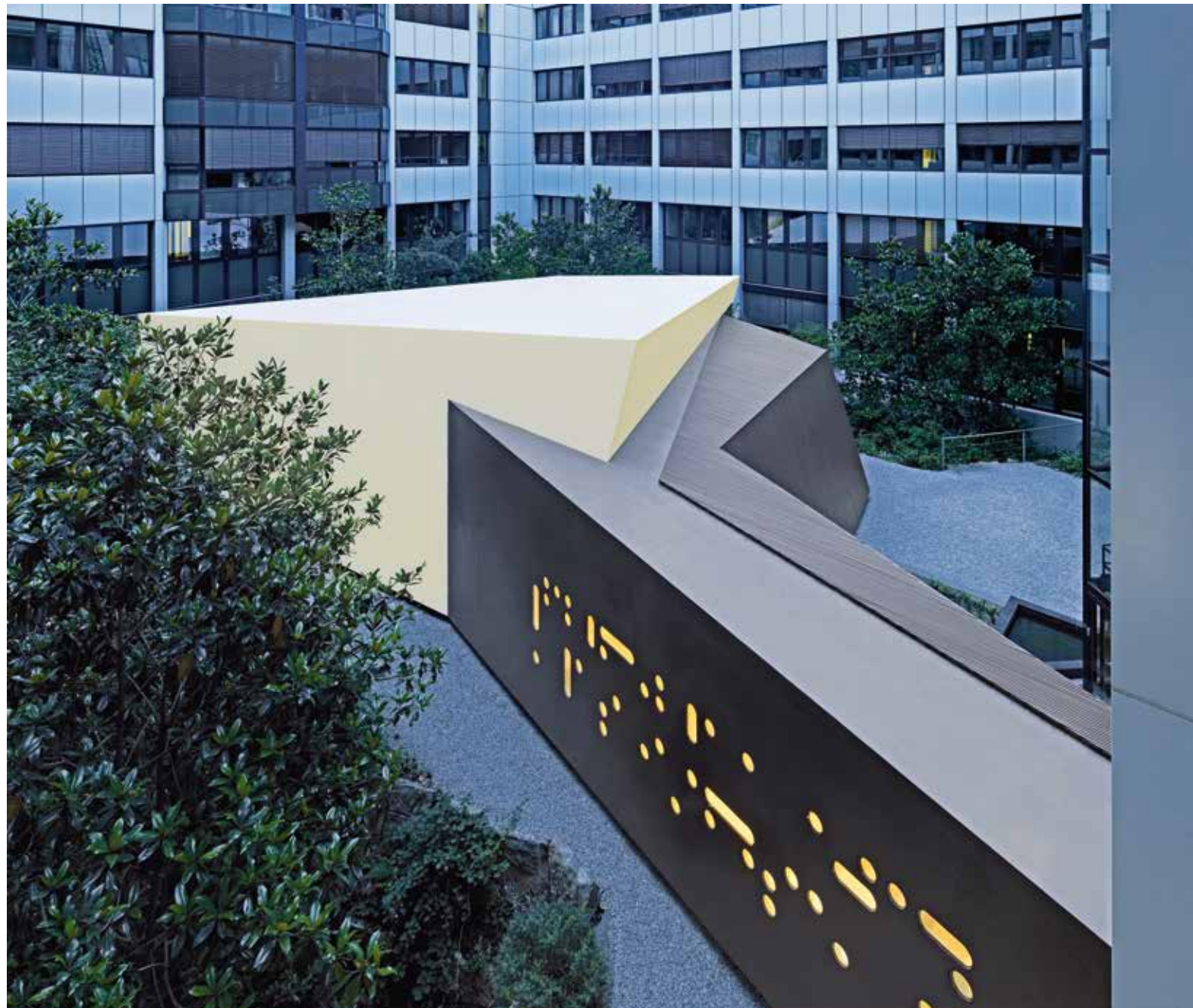
↑ | Exterior view, evening → | Interior

Address: Dietmar-Hopp-Allee 16, 69190 Walldorf, Germany. Client: SAP AG. Completion: 2012. Gross floor area: 240 m 2 . Media art: ARS Electronica Futurelab, Linz. Communication design: Euro RSCG 4D GmbH, Düsseldorf. Industry: IT. Design guidelines: no.